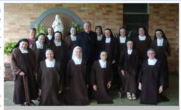
Carmelite community gathered with the Archbishop

Archbishop Bathersby was keen to acknowledge and honour the rich presence of our 'prayerful neighbours' the Carmelite Sisters when refurbishing the Centre. One way we did this was the naming of the Carmel wing containing bedrooms 1-6, in honour of their Carmelite patron. We value the ongoing support and gracious hospitality of the Sisters who welcome us to join their morning mass and visit their chapel for prayer.