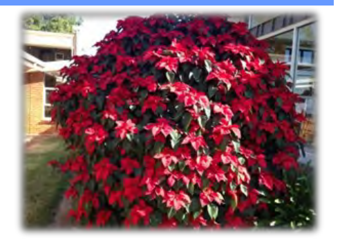
Poinsettia bush in flower for Pentecost

The key projects for this year are some roof repairs recently undertaken to the main building to overcome water leaks and major renovations to the kitchen to provide a modern well equipped culinary space to serve the thousands of guests enjoying the delights of the Mary-Clair catering team. As custom has grown (from 1347 in 2010 to 3,333 visitors in 2014) so has the need for a larger kitchen facility with more preparation benches, greater refrigeration capacity, increased food storage and shelving, improved cleaning facilities and space for a variety of cooking equipment. Design and tendering processes are now complete and once finance approval is given, construction will begin. The Archdiocese continues to support the growth and development of Santa Teresa in pursuit of its mission to be a modern well equipped spiritual formation Centre that provides a place of peace and beauty where guests can encounter God.