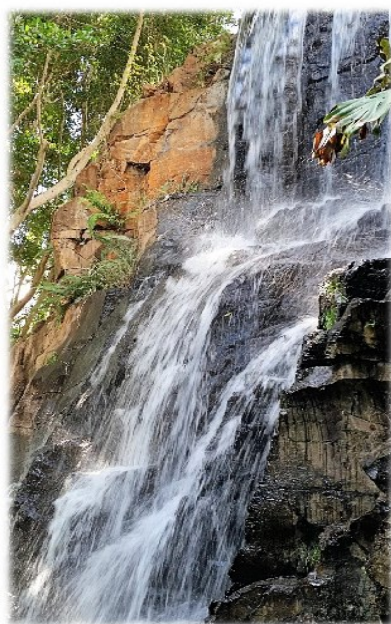
Kathryn Robbie November 2019

Swept into a warm filial embrace Cradled in Divine mystery, Infused with restful completeness A sacred mutual indwelling.