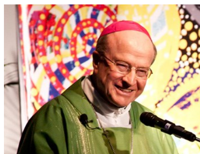
Pray 2010 Conference Eucharist