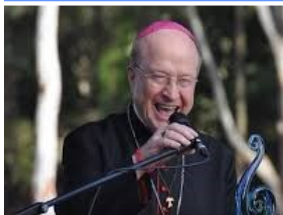
Opening of Santa Teresa 2009