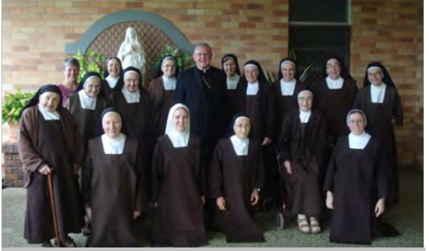
Carmelite community gathered with the Archbishop

Our Lady of Mount Carmel is the title given to the Blessed Virgin Mary in her role as patroness of the Carmelite Order. The first Carmelites were Christian hermits living on Mount Carmel in the Holy Land during the late 12th and early 13th centuries. They built a chapel in the midst of their hermitages which they dedicated to the Blessed Virgin, whom they conceived of as the "Lady of the place." Archbishop Bathersby was keen to acknowledge and honour the rich presence of our 'prayerful neighbours' the Carmelite Sisters when refurbishing the Centre. One way we did this was the naming of the Carmel wing containing bedrooms 1-6, in honour of their Carmelite patron. We value the ongoing support and gracious hospitality of the Sisters who welcome us to join their morning mass and visit their chapel for prayer.