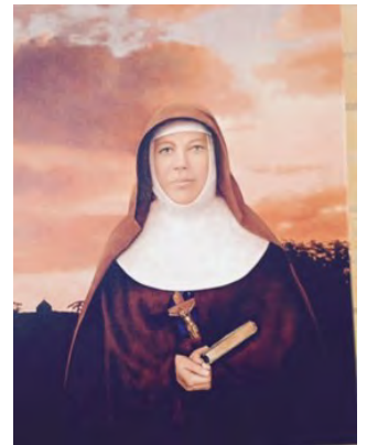
Painting hanging in Mary MacKillop Administration wing

'God's presence seems to follow me everywhere and makes everything I do, or wish to do, a prayer' (1890)