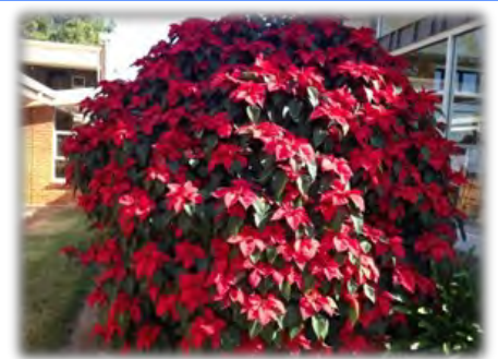
Poinsettia bush in flower for Pentecost

The key projects for this year are some roof repairs recently undertaken to the main building to overcome water leaks and major renovations to the kitchen to provide a modern well equipped culinary space to serve the thousands of guests enjoying the delights of the Mary-Clair catering team. As custom has grown (from 1347 in 2010 to 3,333 visitors in 2014) so has the need for a larger kitchen facility with more preparation benches, greater refrigeration capacity, increased food storage and shelving, improved cleaning facilities and space for a variety of cooking equipment. Design and tendering processes are now complete and once finance approval is given, construction will begin. The Archdiocese continues to support the growth and development of Santa Teresa in pursuit of its mission to be a modern well equipped spiritual formation Centre that provides a place of peace and beauty where guests can encounter God.