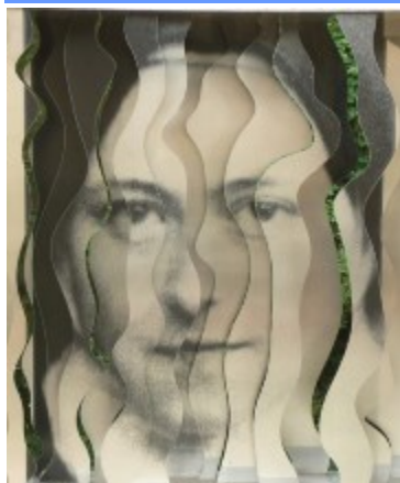
Kindness is my only guiding star. In its light I sail a straight route.

St. Pope John Paul II called St. Therese the 'Doctor of Love' because her 'little way' of holiness makes the Gospel call to love real for all people.